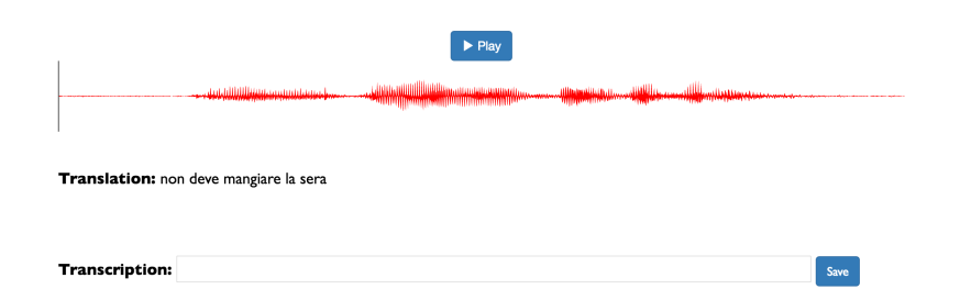
Figure 1: Interface that only provides the translation non deve mangiare la sera [he/she shouldn't eat at night], with no alignment information.